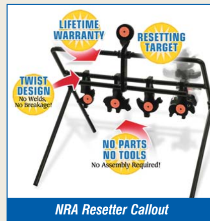
NRA Resetter Callout

Most models also come with “repair pasters” that allow you to cover previous hits, giving each target a longer life, and you more shooting opportunities.